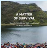
“A Matter of Survival”

The Geneva Water Hub knows that policy must be based on a solid understanding of socio-political processes , if it is to be credible, legitimate, and salient to political processes. The Hub examines how alternative messages may counter damaging narratives, how joint visions and benefits can counter inequitable arrangements, and the extent to which international norms and law are useful in realpolitik. It avoids oversimplification or the provision of simple “solutions” for convenience, even as it communicates these effectively to non-expert audiences. In doing so, the Hub sets the research agenda for water and peace critical and useful research .