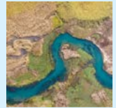
E-learning Course on Water Diplomacy and Integration of Water Norms in Peacebuilding