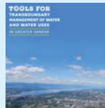
Tools for transboundary management of water and water uses in the greater Geneva