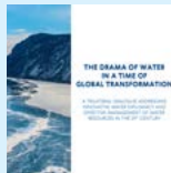
The Drama of Water in a Time of Global Transformation