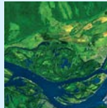
Online Course on International Water Law and the Law of Transboundary Aquifers