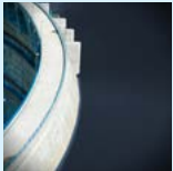
MOOC on Water Resources Management and Policy

As part of the Geneva Water Hub’s extensive alumni network, trained professionals form a community of practitioners to advance water for peace well into the future.