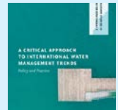
“A Critical Approach to International Water Management Trends - Policy and Practice.”